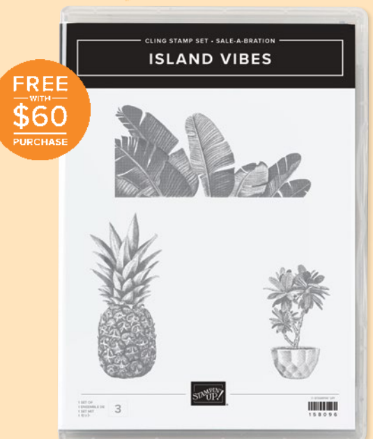
INK. ISLAND VIBES • 158096 FREE!

3 cling stamps (suggested clear blocks: d, e)